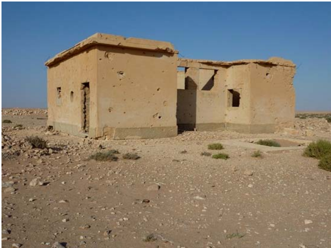
The blockhouse in 1941 and in 2009.