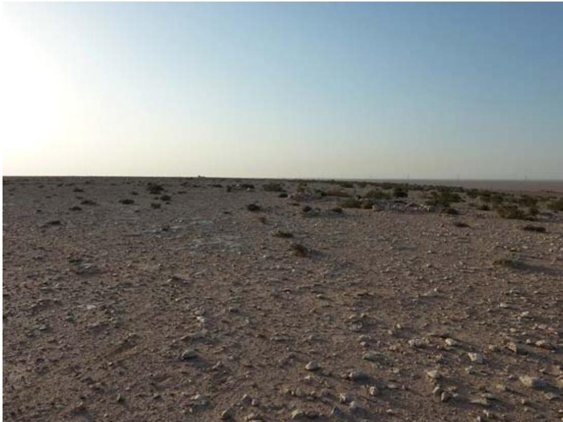
Looking towards Point 175 with the edge of the escarpment to the right of the picture. Note the sangars (rocks piled up for protection where it was too rocky to dig in) on the side of the escarpment.