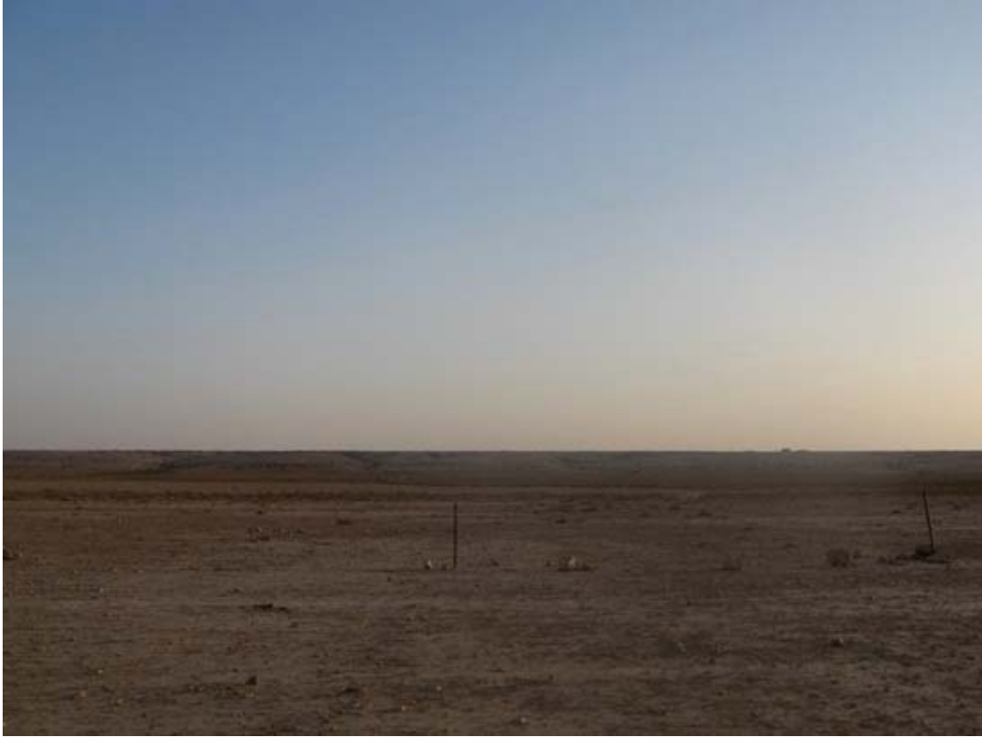
The blockhouse in the evening, on top of the escarpment, from the Trigh Capuzzo.