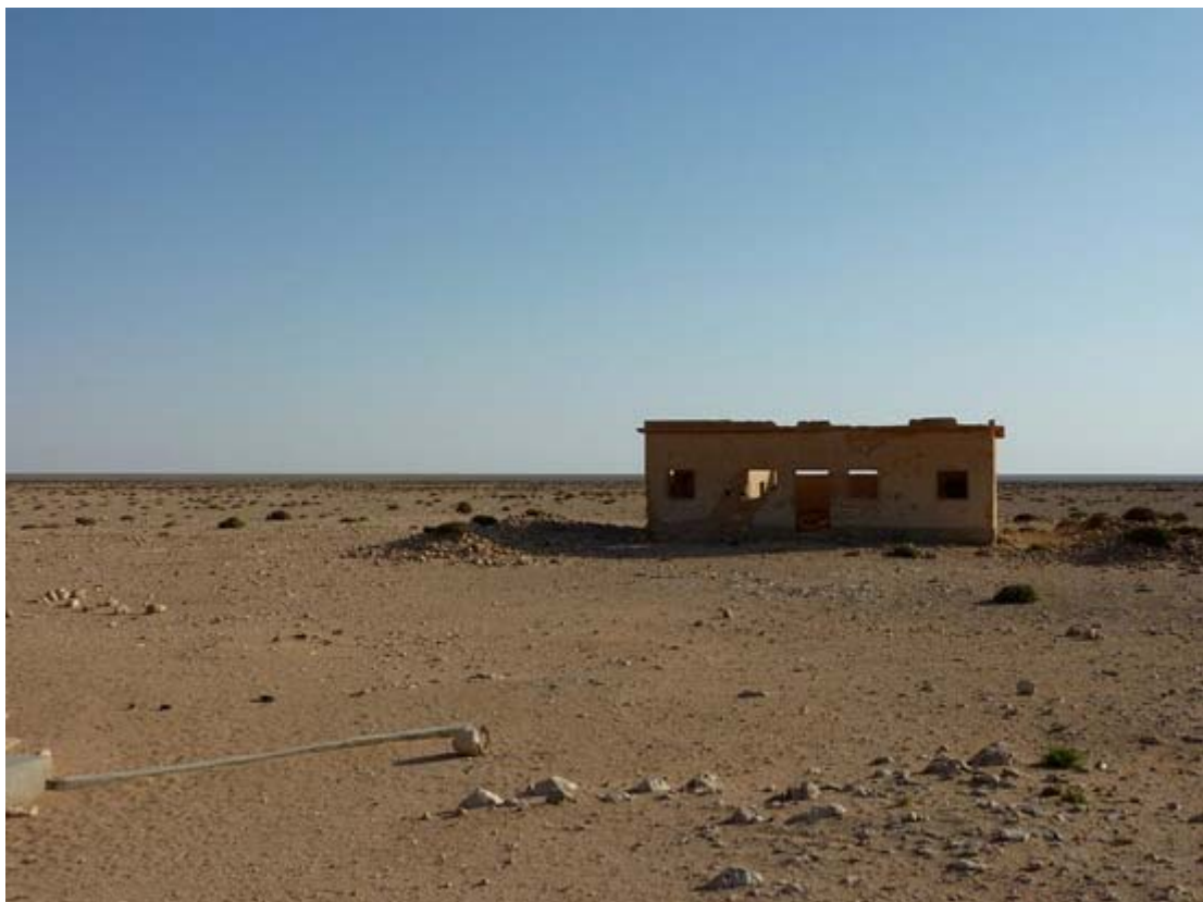
The front of the blockhouse. Note where it has been hit by a shell at the top of the wall on the