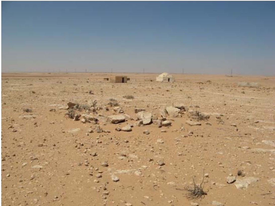
The mosque with a sangar in the foreground. Ed Duda is in the direction of the far left horizon and Belhamed of the centre left horizon.