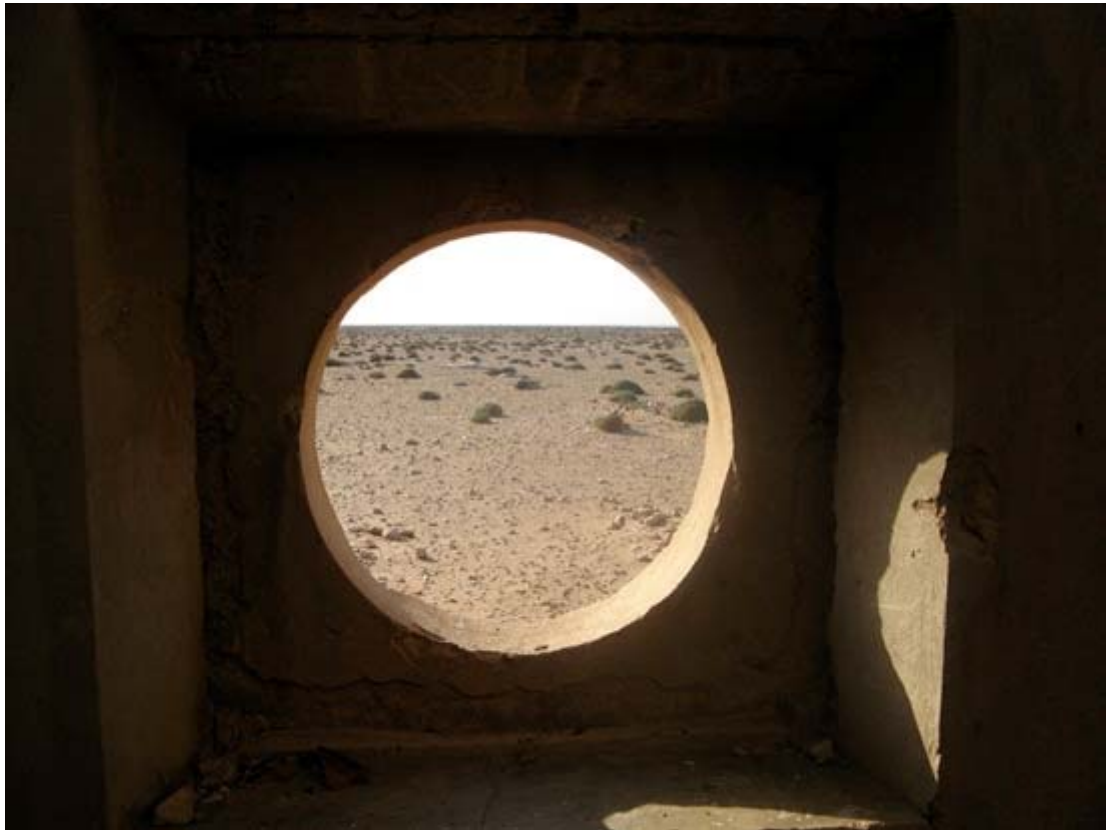
Looking from the blockhouse towards the south-west in the direction of the airfield.