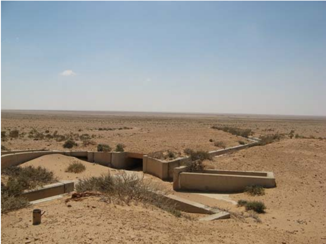
Italian strongpoint near Ed Duda beside the By-pass Road, near the area where the 4 Brigade troops linked with the Tobruk garrison.

The area around the mosque was eventually taken on the night of 26–27 November. But 6 Brigade had been so badly knocked around that the task of linking with the Tobruk forces was given to the men of 4 Brigade. The link was finally achieved on the 27th at Ed Duda. For a few days there was a corridor open through to Tobruk, although the hold on the ridge was quite tenuous. The machine gun platoons were assigned to the infantry battalions and 9 Platoon was ordered back to join the engineers of 8 Field Company, to protect the southern flank.