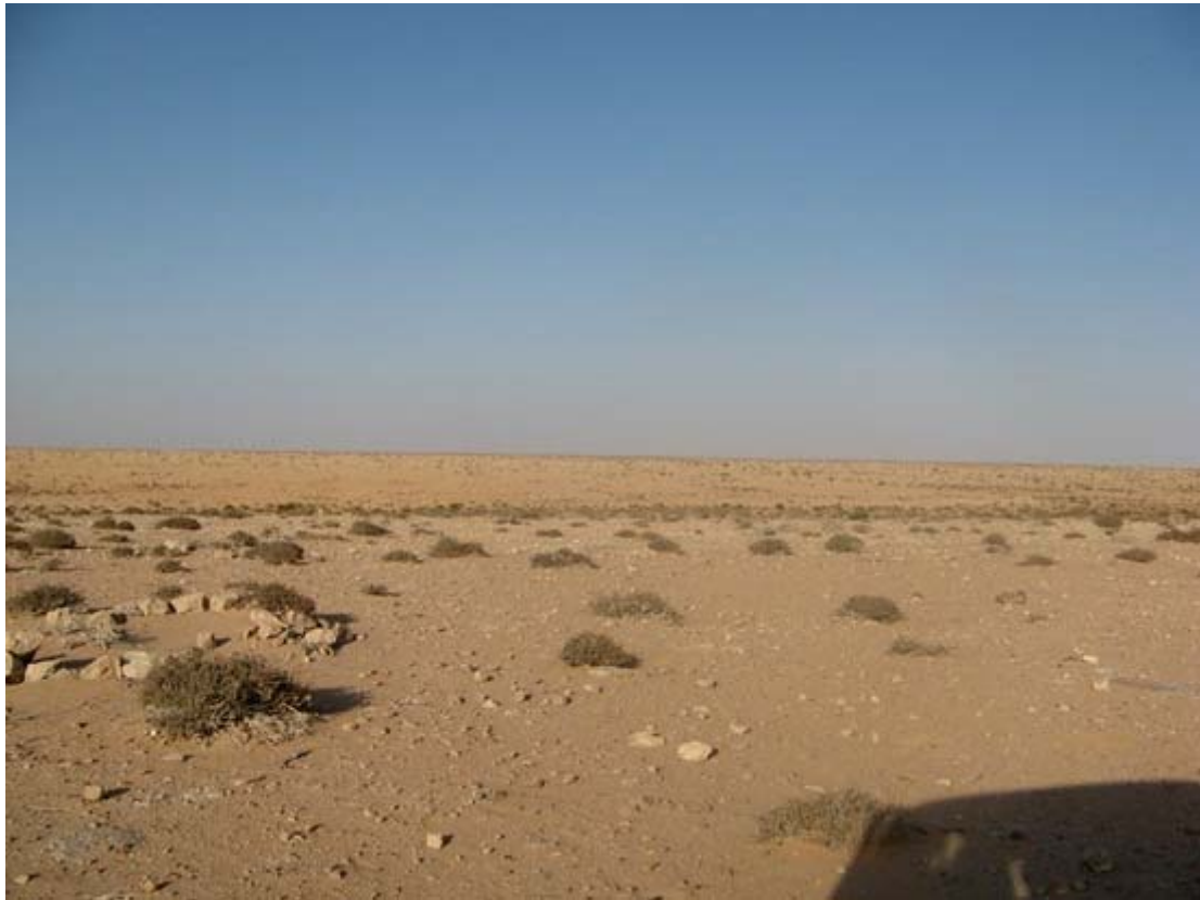
Looking eastwards down into the wadi Rugbet en-Nbeidat, the valley that curls left to right across the photo. The far side of the wadi rises towards Point 175. Note the sangar in the left foreground.