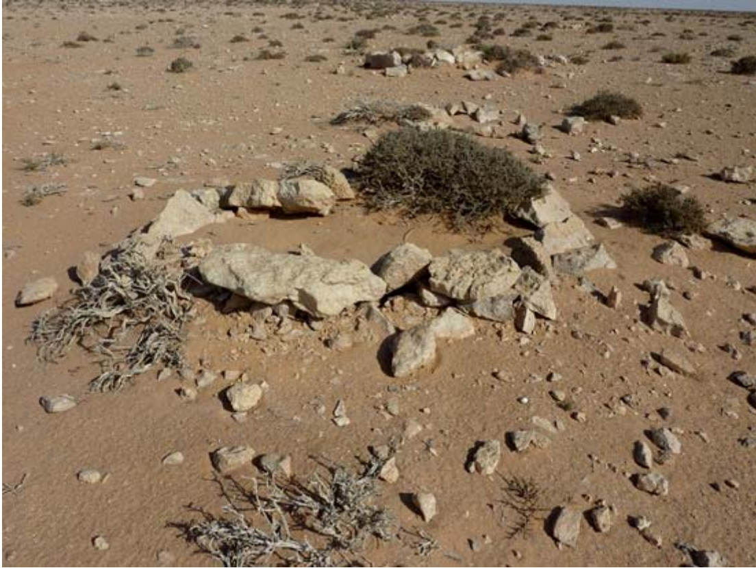
Close-up of some of the sangars.