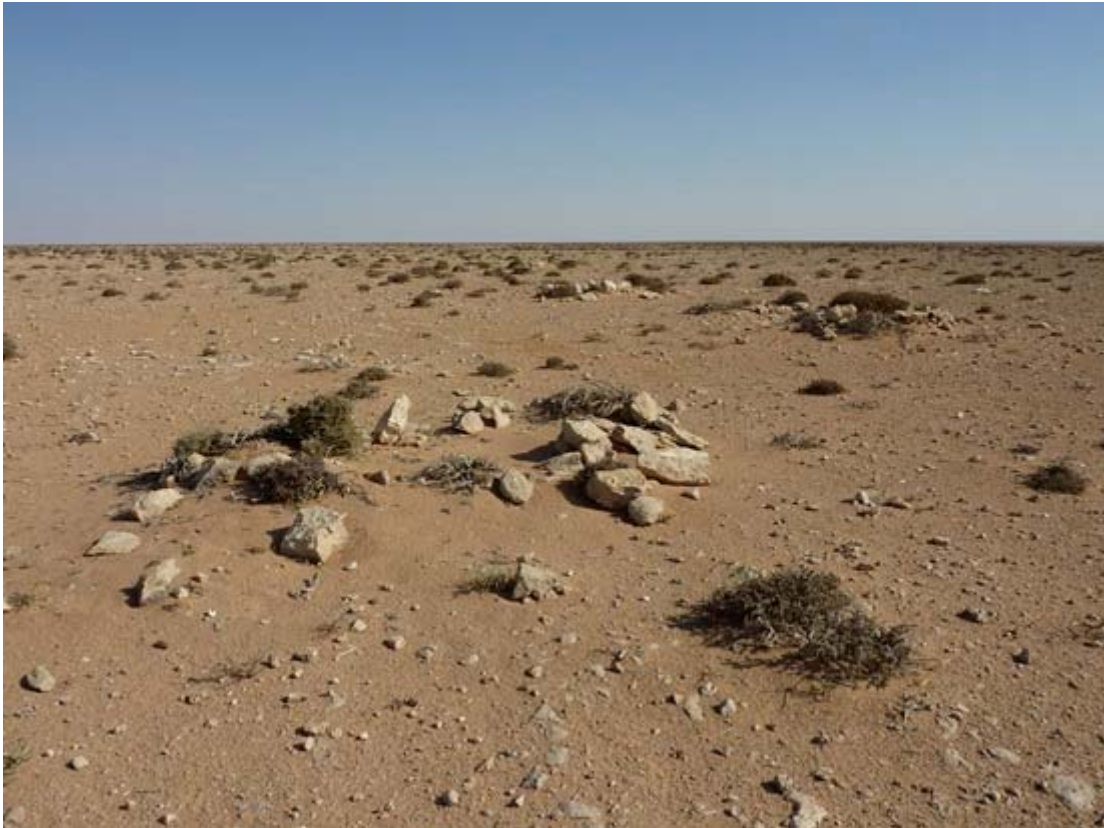
Sangars on top of the Sidi Rezegh escarpment, above the mosque, in the area where 9 Platoon dug in on the night of 25 November.

At 11 p.m. on the 25th 3 Company moved west again, supporting the infantry battalions that were attacking the area around the mosque. The intention was to secure a box around this area and allow for a move through the box towards Ed Duda to link up with the garrison breaking out from Tobruk. The machine gun platoons were assigned to support the infantry battalions, but 7 and 9 Platoons were taken too far forward as part of the advance. The men attempted to dig in to consolidate their positions but the rocky ground made this very difficult.