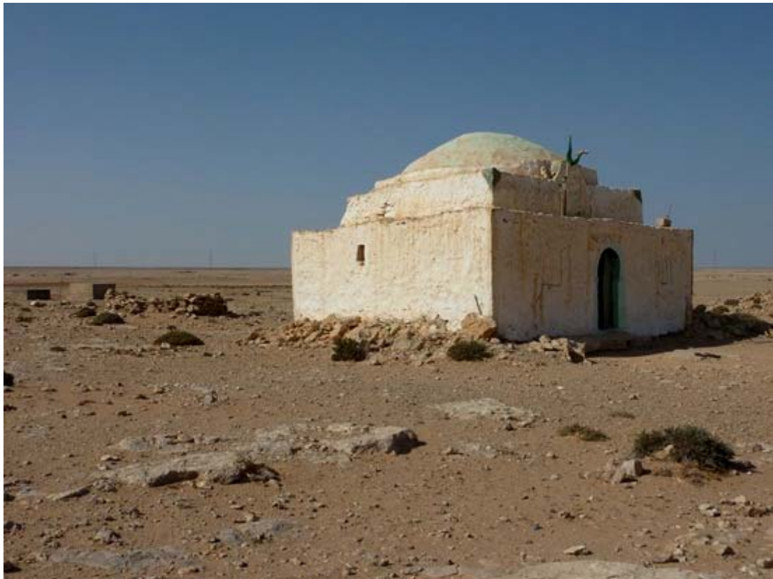
The mosque in 1941 and in 2009.