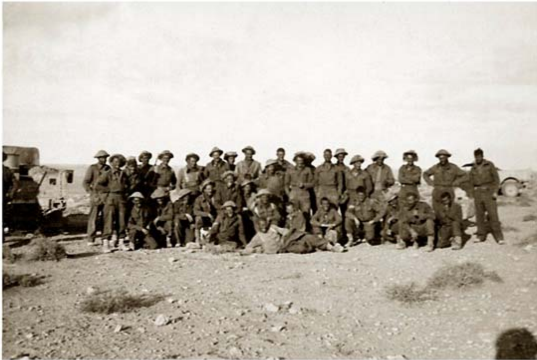
3 Company after Sidi Rezegh

After the withdrawal, a photo was taken of 3 Company. According to one platoon member the company had started 134 strong, and by the end of the campaign had been reduced to 38. All the 6 Brigade battalions had suffered heavy casualties and had been severely depleted. At least 15 men from 3 Company were killed in the campaign, including eight from 9 Platoon.