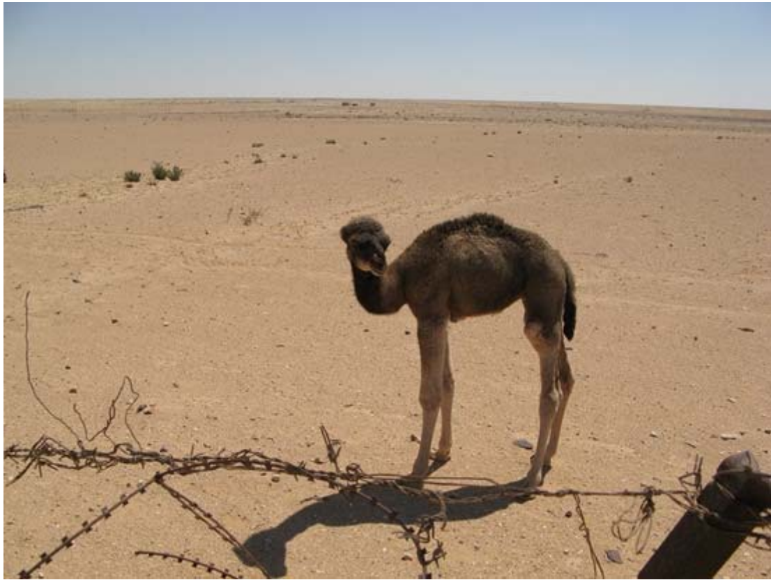
The Sidi Rezegh escarpment from the Trigh Capuzzo; the mosque is among the buildings above the head of the camel.