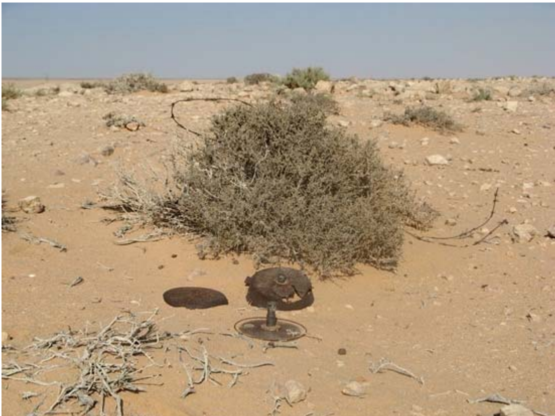
As well as sangars, the escarpment above the mosque still contains many landmines and a