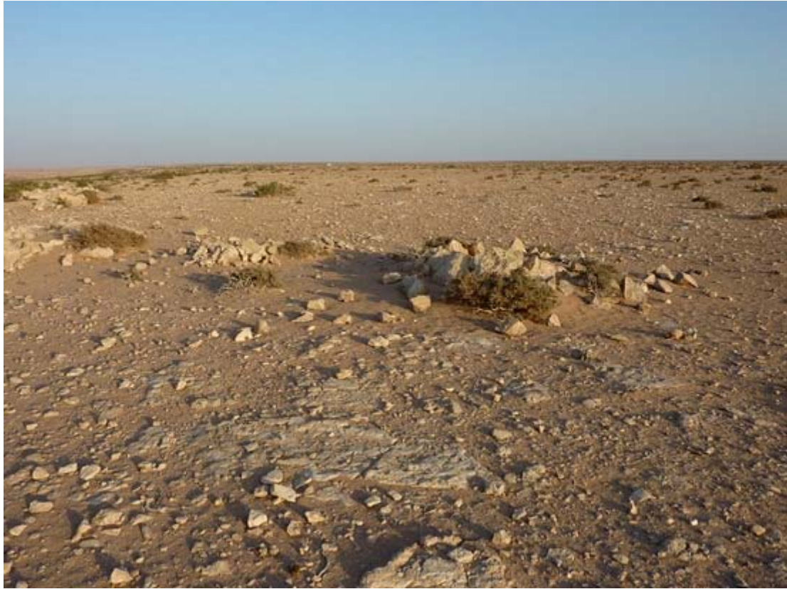
Close-up of some of the sangars by the side of the escarpment on the approaches to Point 175. This is looking back eastwards, the direction from which the platoon advanced.